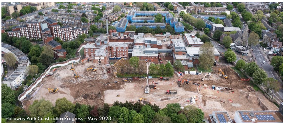
Holloway Park Construction Progress – May 2023