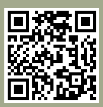
Scan this QR code using your phone camera to visit our website.

You can also sign up to receive these newsletters and other updates via email if you'd like to.