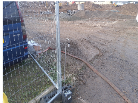
Date and time: 01/12/2023 10:34:35 Comments: DQ2028 Perimeter Air Monitoring