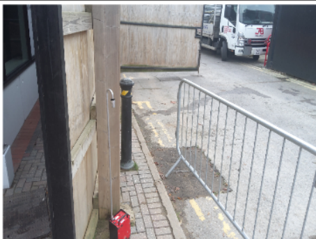
Date and time: 01/12/2023 11:44:05 Comments: DQ2029 Perimeter Air Monitoring