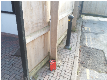
Date and time: 01/12/2023 10:31:15 Comments: DQ2027 Perimeter Air Monitoring