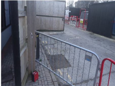
Date and time: 01/12/2023 09:31:37 Comments: DQ2025 Perimeter Air Monitoring