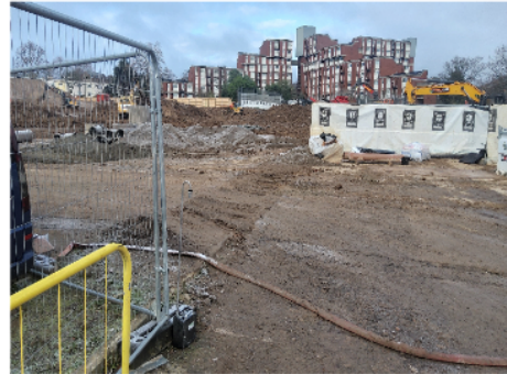
Date and time: 01/12/2023 09:34:47 Comments: DQ2026 Perimeter Air Monitoring