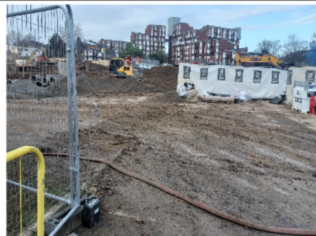
Date and time: 01/12/2023 11:47:06 Comments: DQ2030 Perimeter Air Monitoring