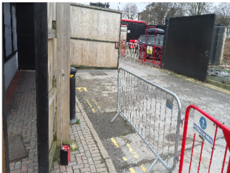
Date and time: 03/01/2024 11:23:36 Comments: DQ2103 Perimeter Air Monitoring