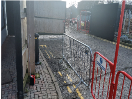
Date and time: 03/01/2024 10:19:59 Comments: DQ2101 Perimeter Air Monitoring