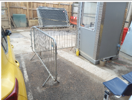
Date and time: 03/01/2024 11:28:17 Comments: DQ2105 Perimeter Air Monitoring