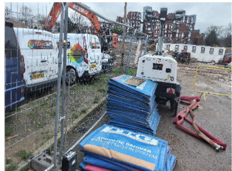
Date and time: 03/01/2024 11:25:34 Comments: DQ2104 Perimeter Air Monitoring