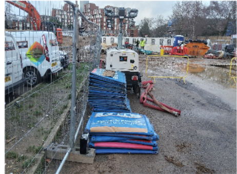
Date and time: 03/01/2024 10:22:57 Comments: DQ2102 Perimeter Air Monitoring