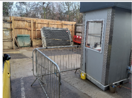
Date and time: 03/01/2024 12:47:38 Comments: DQ2106 Perimeter Air Monitoring