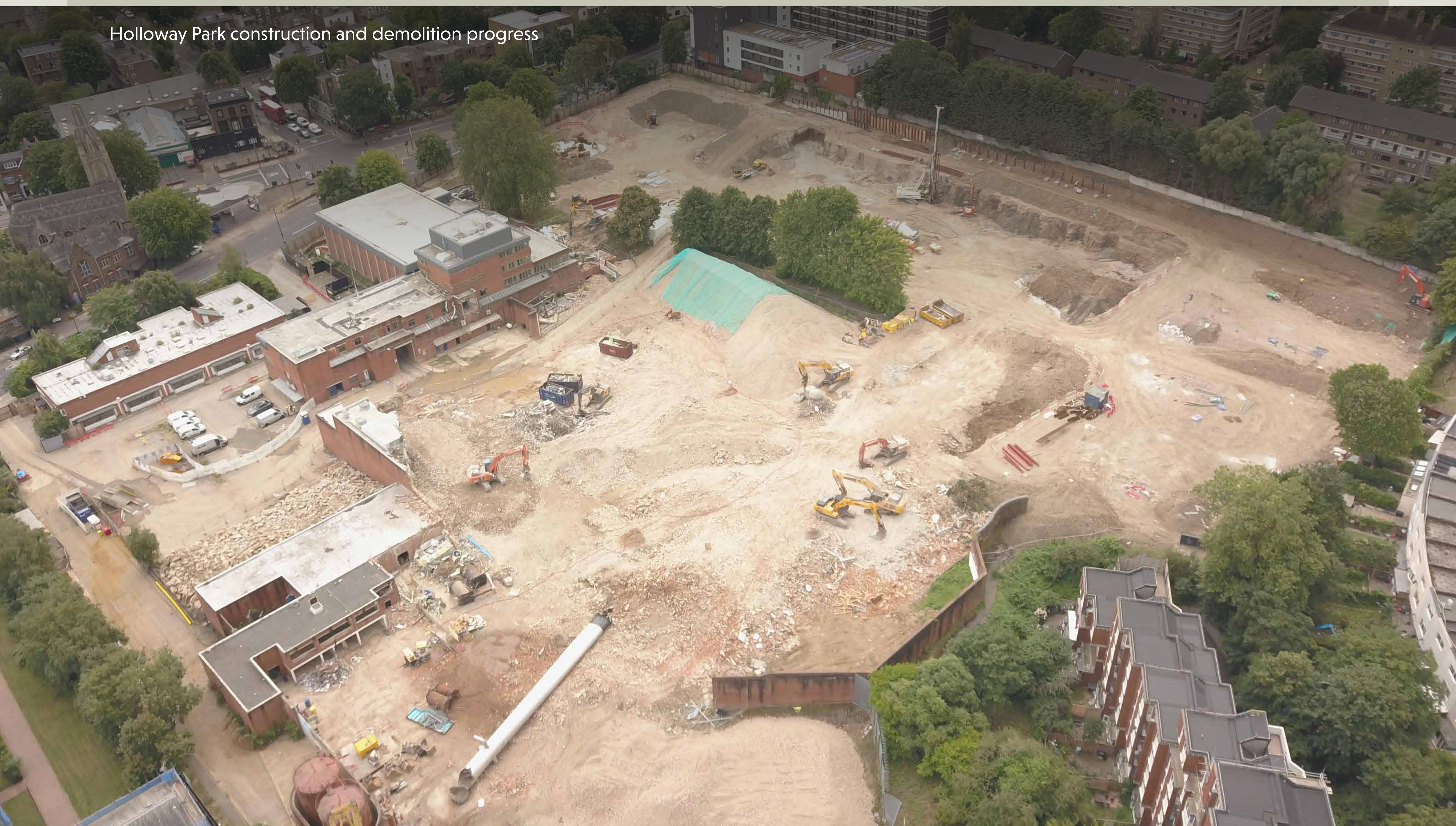
Holloway Park construction and demolition progress