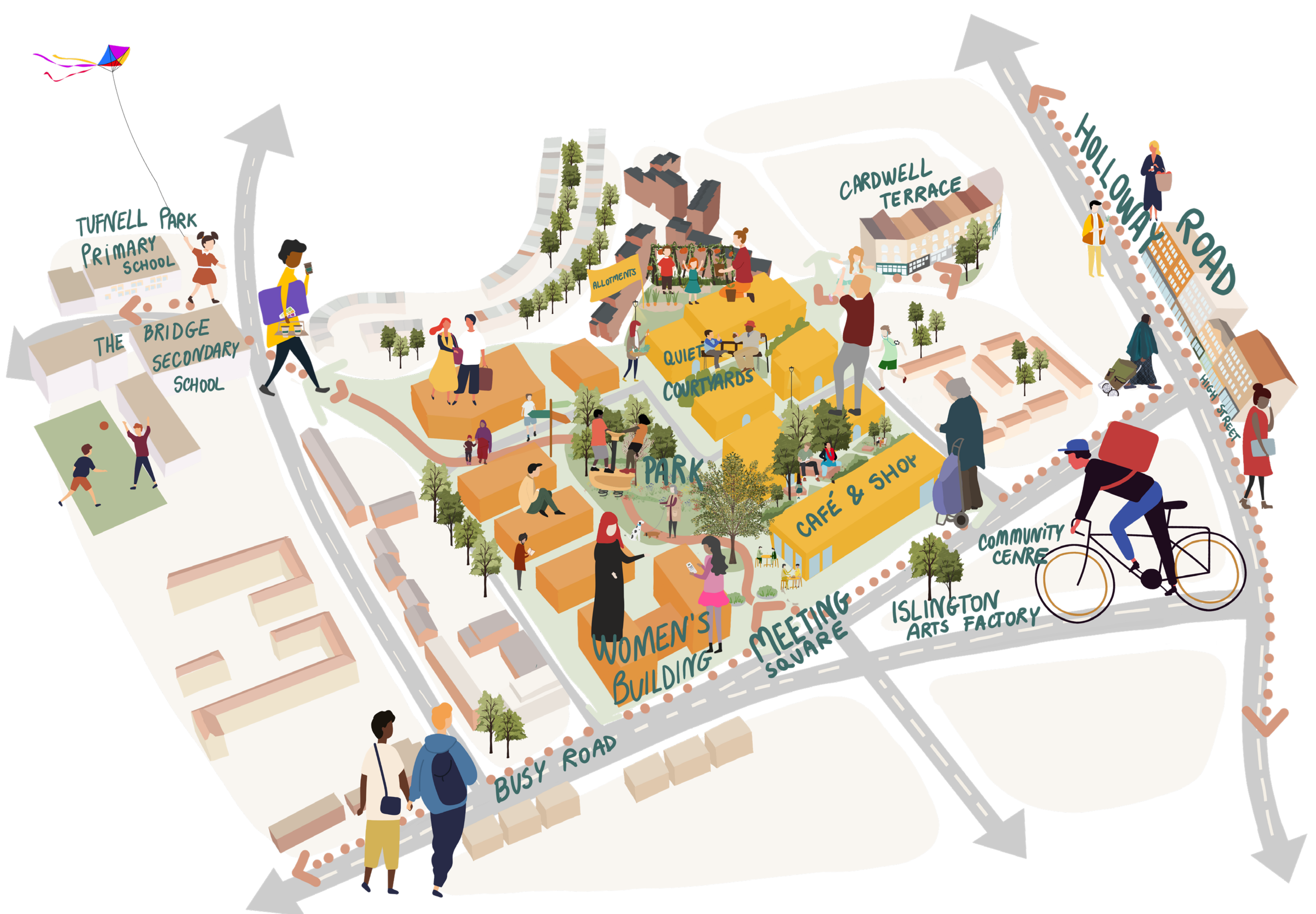
Artistic sketch of the Holloway Park masterplan

✉ Email us at info@hollowayparkconsultation.co.uk