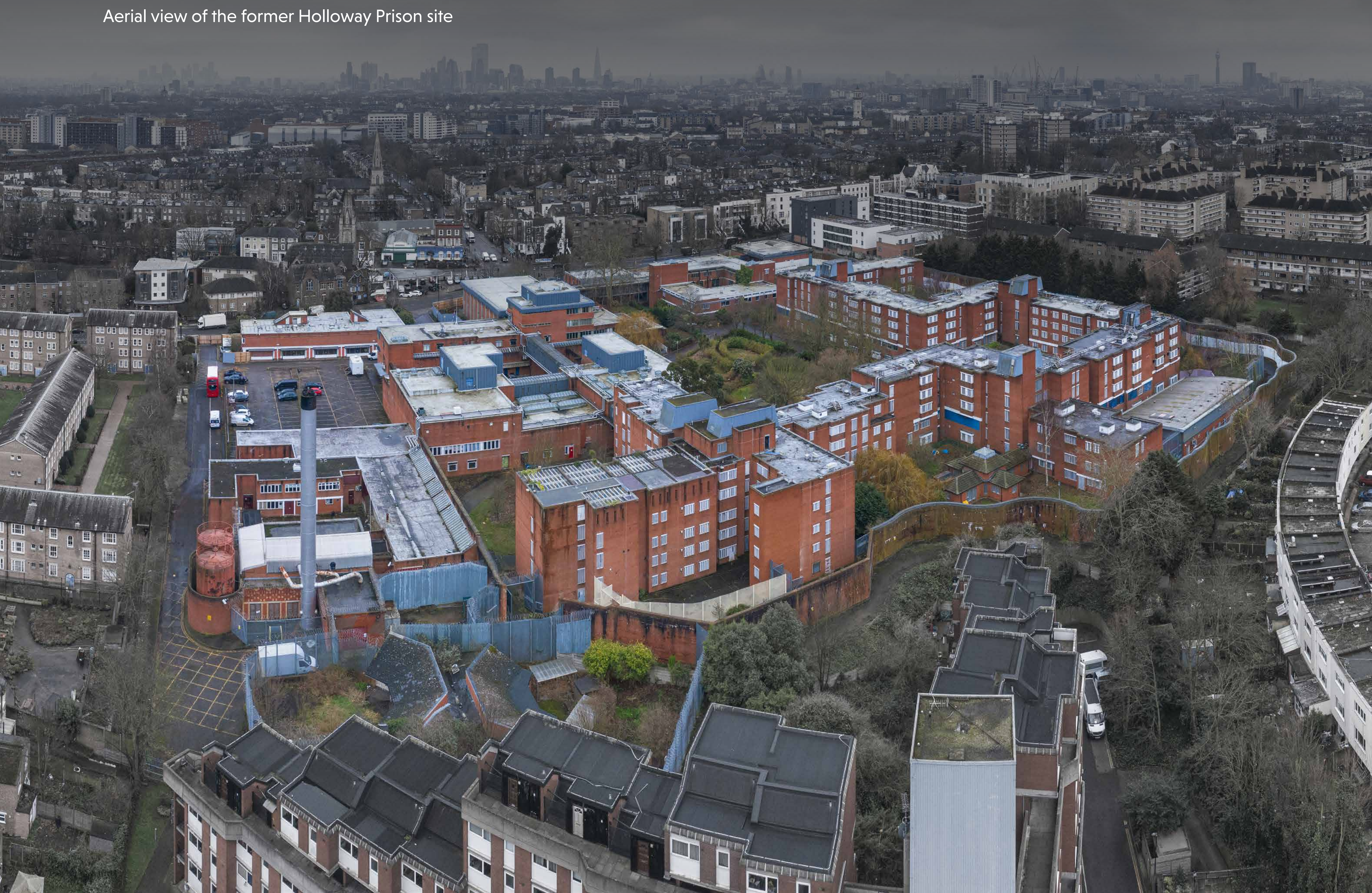
Aerial view of the former Holloway Prison site

51 construction apprenticeships , with aspirational target of 30% to women.